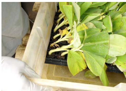
Banana seedlings in rooting tray dipped in endophyte spore suspension.

This and other IPM Briefs are available from www.spipm.cgiar.org