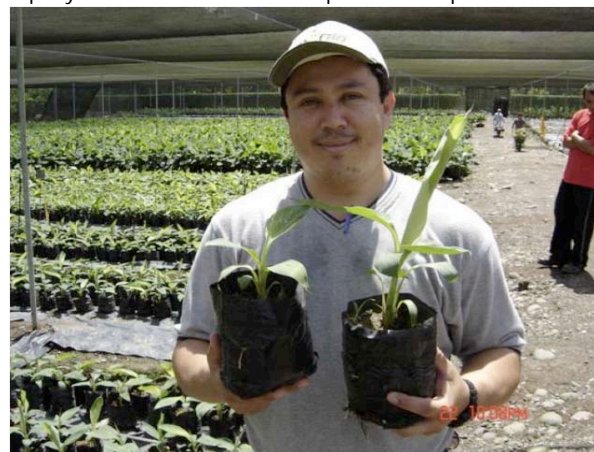
Endophyte treated (right) and untreated (left) banana seedlings of same age. – A. zum Felde

Engaging in such public-private partnerships facilitates the transition of research results into commercially available products, for use to the benefit of many.